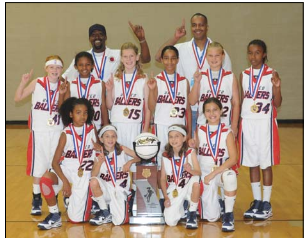
The United Ballers