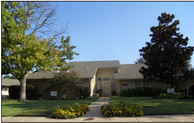
Shimon Braff—7628 Pennyburn