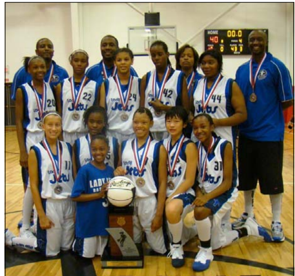
Lady Jets Basketball Team