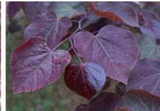
Redbud Burgundy Heart